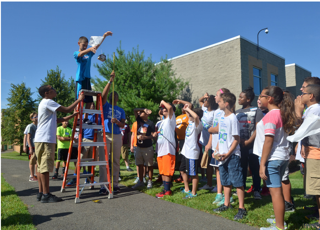
Photo Caption: Students of PCTI’s Summer STEM Academy work in groups to participate in the egg-drop challenge.

PCTI’s Summer STEM Academy seeks to gauge the interest of middle school students across Passaic County and to provide enriching and educational experiences to future engineers, scientists, and technology experts in the areas of science, technology, engineering, and math.